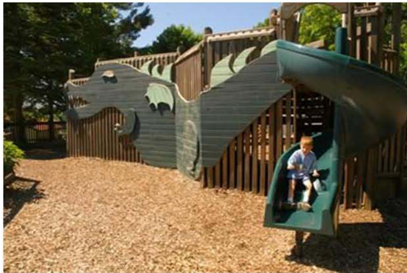
Seen above is Eckhardt Park located on West Court St. (Right next to the courthouse.)